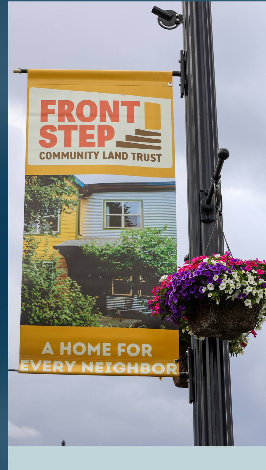
Showcase New Brands